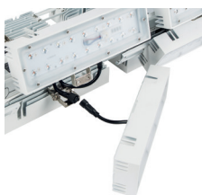
Independent LED module Can be easily replaced in case of disruption