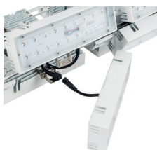
Independent LED module Can be easily replaced in case of disruption